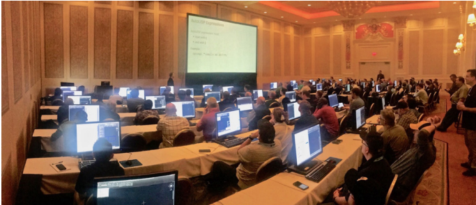
One of six computer labs that was used to deliver hands-on training to attendees through Frame on Azure

In the past, we had the luxury of a longer setup. We had seven to nine days to set up the 400 workstations in the hands-on labs. We needed that much time to push all the hardware and updates to the systems. But a few years ago, the setup time dropped to just three days. We had to figure out how to do the same deployment in a shorter time frame. It forced us to think about how to do things differently, since keeping everything physical would be a challenge. That's why we moved to virtual.